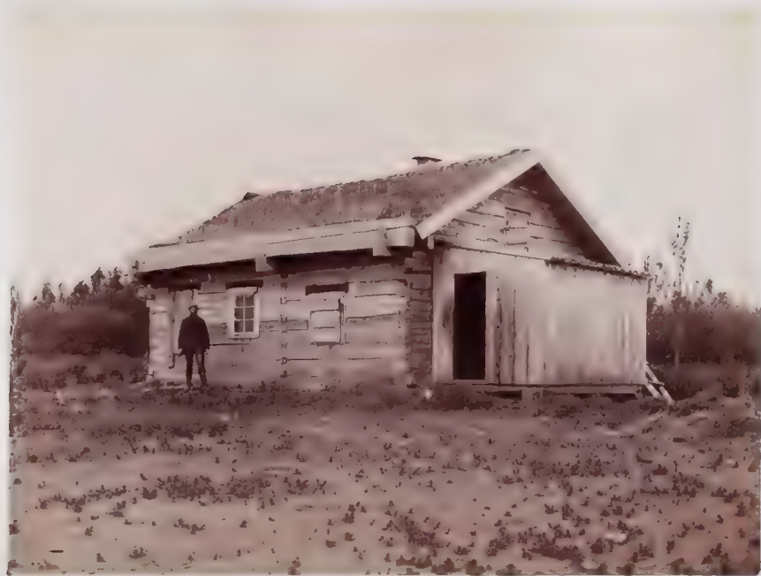
House on Kuskawim River